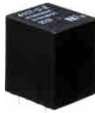
Open Type 13.2×15.3×18