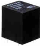
Open Type 13.2×15.3×18