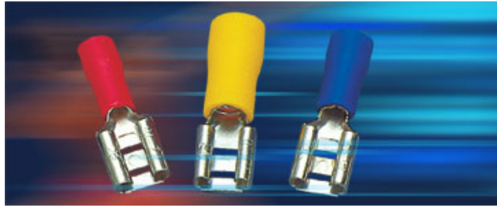
【 Insulated Female Terminals Size Drawing】