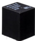
Dust Covered 17.5×15×20